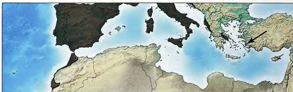
Fig. 3. Known distribution of Cacyreus marshalli in Europe and North Africa (shaded area; modified from Tshikolovets 2011), and the approximate position of the observation in Turkey (red circle, arrow).